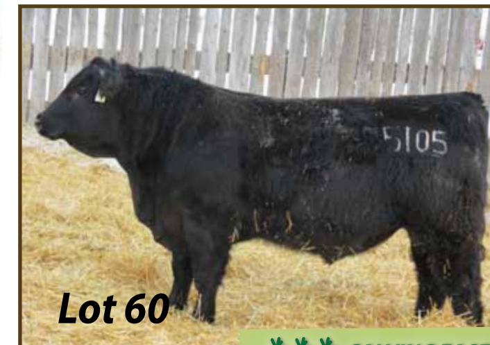
Lot 60 *** CALVING EASE