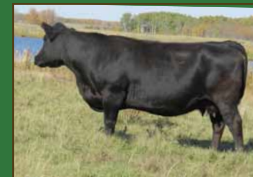
CRESCENT CREEK BARESS 6T