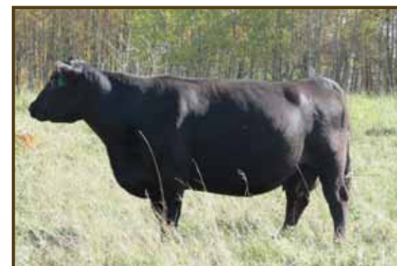
DAM, KBJ BLACK NANCE 608R

The leadoff bull of this offering from a never miss BLACK NANCE 608R. Lots of muscle on a moderate frame. Recommended for heifers. Fresh outcross genetics.