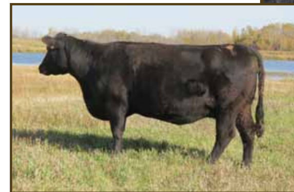
DAM, IVANHOE B.E. ROYAL 24Y

Another excellent 67X son which could be used in the heifer pen. Maternal brother to the lead off bull from last year's sale to Bench Farming.