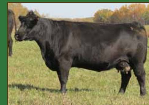
CRESCENT CREEK QUEEN RUTH 14W