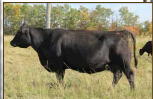
DAM, CRESCENT CREEK ROSEBUD 14R