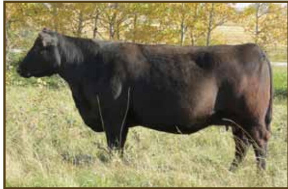
DAM, CRESCENT CREEK DUCHESS 63W