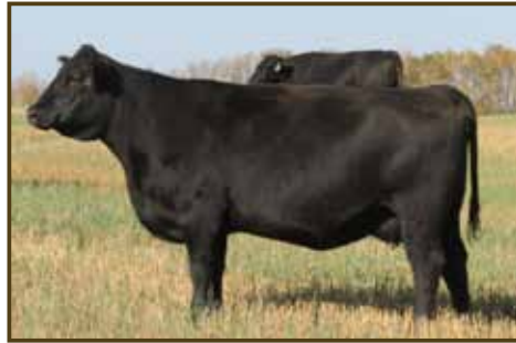
DAM, CRESCENT CREEK LASSIE 38X