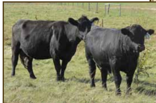
DAM, CRESCENT CREEK HEROINE 076N AND WOS 9C

One of the elite bulls in the offering, 9C has always been a standout. Exceptional length and muscle pattern are backed by one of the most prolific QUANTUM 963 daughters in the herd. 076N has been designated an "Elite" cow through the Canadian Angus Performance program. She has never missed. We think a lot of this fellow and will retain a 1/2 interest 1/2 possession. A unique opportunity to acquire a definite herd bull in the making.