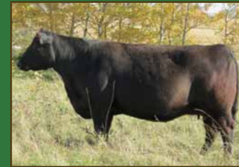
CRESCENT CREEK DUCHESS 63W