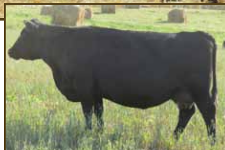
DAM, YOUNG DALE ERICA 61P