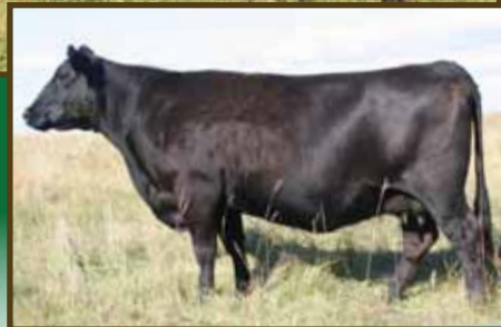
SINCLAIR ENTREPRENEUR 8R101