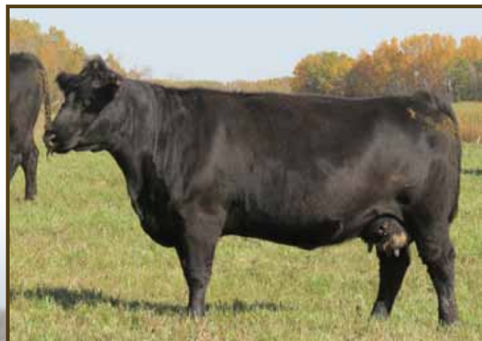
DAM, CRESCENT CREEK QUEEN RUTH 14W