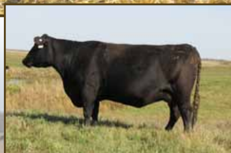
Dam, Crescent Creek Rosebud 200Y