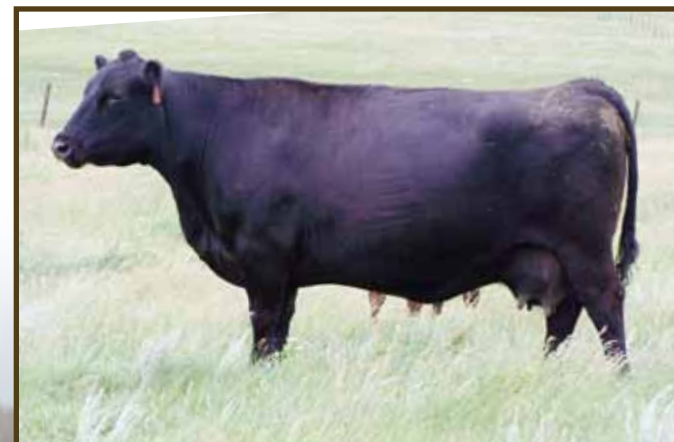
GRAND DAM, CRESCENT CREEK ROSEBUD 115F