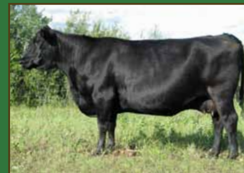
CRESCENT CREEK LASSIE 48N