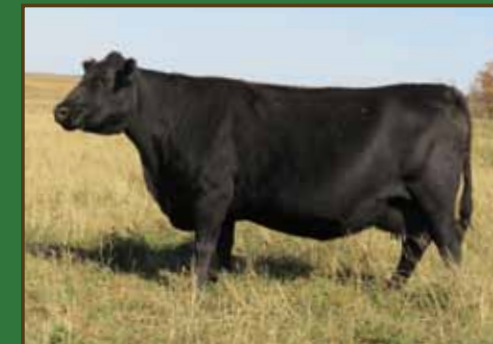
CRESCENT CREEK STUMPIE 9R