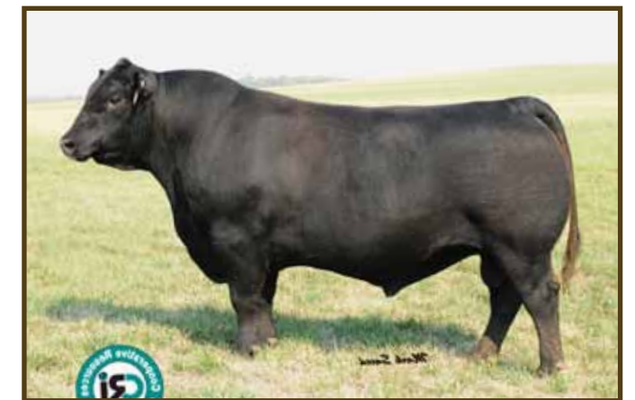
SIRE, CONNEALY IMPRINT 8317 LOT 2, 3 & 4

CONNEALY REFLECTION AMF CAF NHF DDF CONNEALY IMPRESSION AMF CAF NHF DDF PEARL PAMMY OF CONANGA 194 CAF DDF Sire: CONNEALY IMPRINT 8317 G A R GRID MAKER AMF CAF NHF DDF ELLINA OF CONANGA 868 7127 ELIGENCE PLUS OF CONANGA S ALLIANCE 3313 AMF S CHISUM 6175 AMF CAF NHF DDF S GLORIA 464 Dam: CRESCENT CREEK DUCHESS 13A CAR IDEAL 061 CRESCENT CREEK DUCHESS 18T CRESCENT CREEK DUCHESS 51M