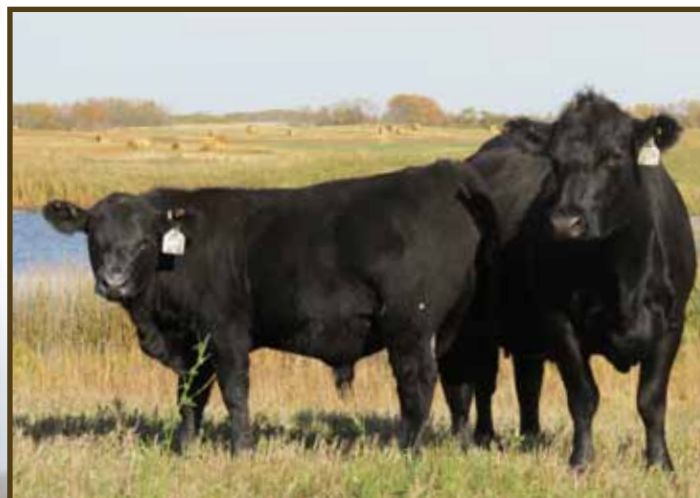
DAM, CRESCENT CREEK QUEEN RUTH 14W & LOT 27