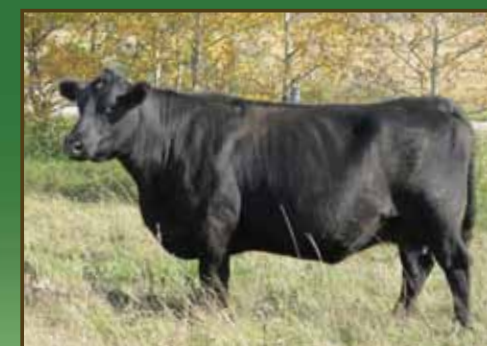
CRESCENT CREEK ERICA 46T