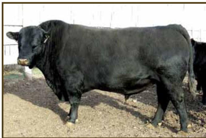
SIRE, CRESCENT CREEK PACESETTER 20U

WILLABAR AMBUSH 45G LOOKOUT PACESETTER 258M GRASSY LANES MILLY 29U Sire: CRESCENT CREEK PACESETTER 20U RITO 8094 PRAIRIELANE 2060 AMF CRESCENT CREEK ROSEBUD 115F CRESCENT CREEK ROSEBUD 4C FIGURE 8 ANGUS TOM BOY 509R LOOKOUT HUCK 53T LOOKOUT EDNA 145L Dam: CRESCENT CREEK ROSEBUD 152Y B C LOOKOUT 7024 AMF CAF NHF DDF CRESCENT CREEK ROSEBUD 43W CRESCENT CREEK ROSEBUD 24L