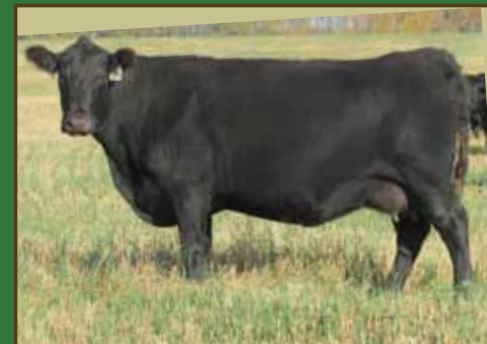
CRESCENT CREEK ROSEBUD 174W