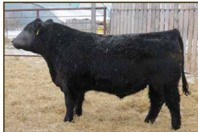
DTZ 103B LOT 40 IN 2015 SALE - MATERNAL BROTHER TO LOT 50