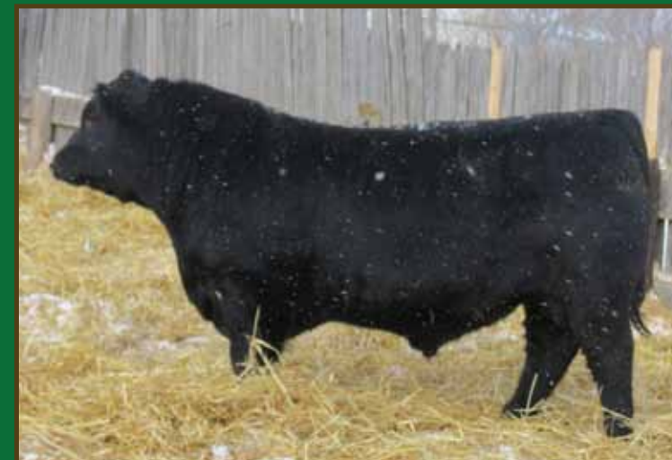
CO-OWNED WITH BENLOCK FARMS