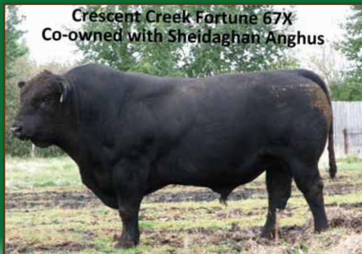
Crescent Creek Fortune 67X Co-owned with Sheidaghan Angus

67X continues to impress with another strong offering this year. The bulls are uniform in type and size. The maternal strength of this bull will be admired for a long time as his pedigree is stacked with some of the most predictable bloodlines around. Bulls with plenty of frame and lots of capacity on very sound feet & legs. A nice sire group to choose some ½ siblings from.