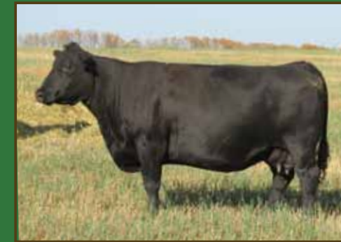
CRESCENT CREEK NANCE 44T