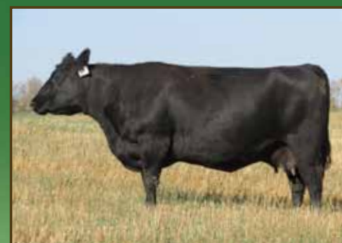
CRESCENT CREEK ROSEBUD 30T