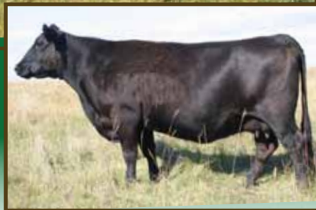
MISS WIX 7176 OF MC CUMBER