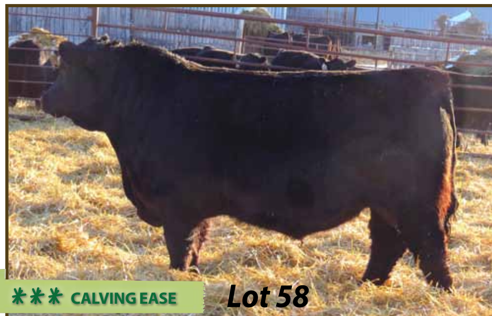
*** CALVING EASE Lot 58