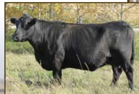
DAM, CRESCENT CREEK ERICA 46T