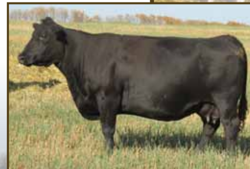
DAM, CRESCENT CREEK NANCE 44T

This is an animal that could have started the offering but may start the sale this year.