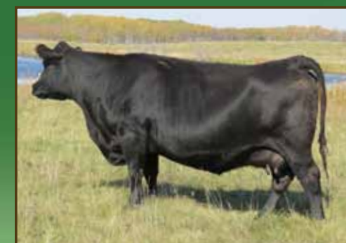
CRESCENT CREEK STUMPIE 96X