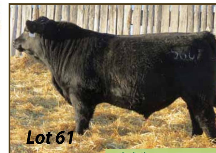
Lot 61 *** CALVING EASE