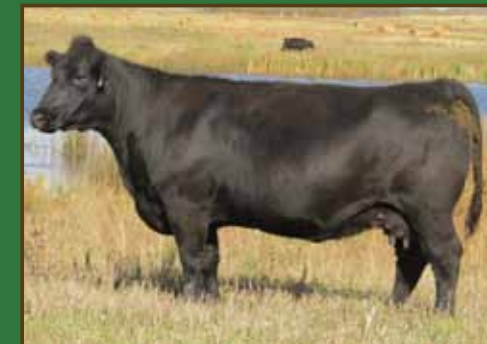
CRESCENT CREEK QUEEN RUTH 56T