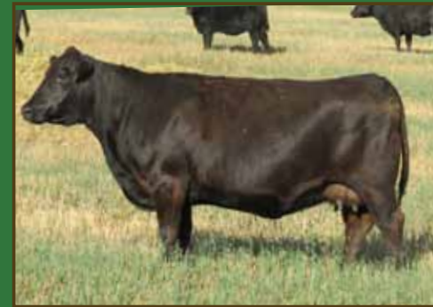
DRYLAND CRUSHMAID 732