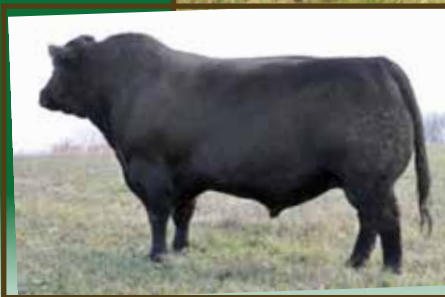
SINCLAIR ENTREPRENEUR 8R101