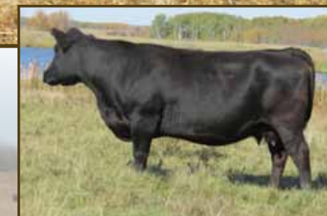
DAM, CRESCENT CREEK BARESS 6T